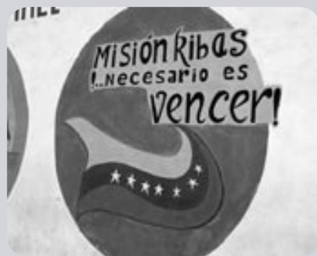
Mission Ribas is the government-sponsored high school equivalency program in Venezuela.

During my week-long trip to Venezuela, I had the opportunity to visit a rural classroom where Mission Ribas classes were taking place. Several students were seated and studying toward high school diplomas. They had all left school years before to find work and support their families. I asked them what they planned to do after graduation and they all agreed that reliable income was their top priority. Sensing some simi-