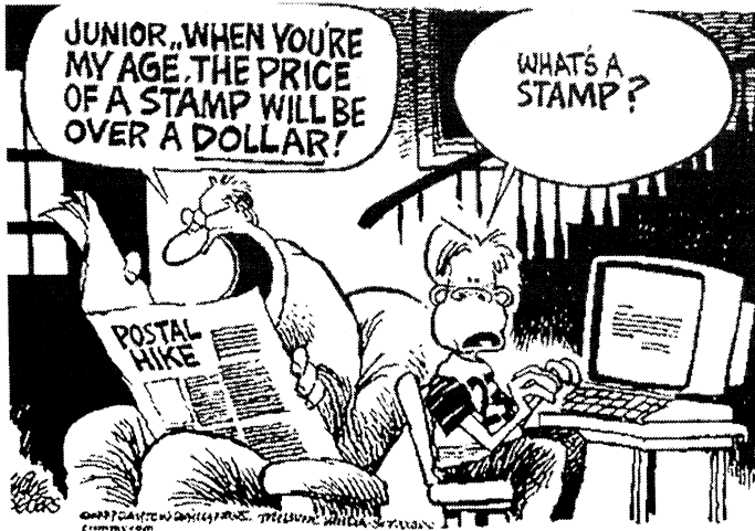
Source: "What's A Stamp?" Mike Peters, Dayton Daily News , 6 January 1999. Copyright Tribune Media Services. All rights reserved. Reprinted with permission.

Question 7 refers to the following cartoon